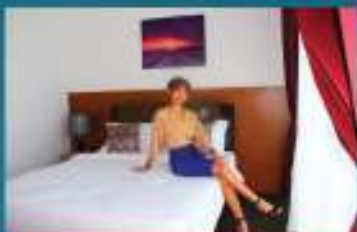
HOTEL SIMULATION ROOM