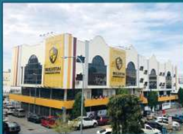
BRIGHTON INTERNATIONAL SCHOOL, KUALA LUMPUR