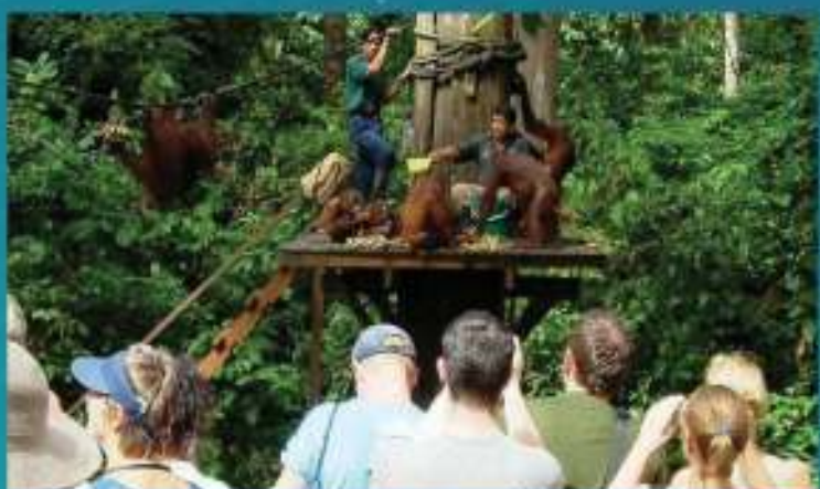
SEPILOK, ORANGHUTAN REHABILITATION CENTRE

A sanctuary away from the city, prep yourself before a kundasang trip with our comprehensive guide on what to know and where to go for your next visit to the Land below the wind.