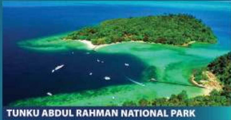
TUNKU ABDUL RAHMAN NATIONAL PARK

The marine park is a cluster of Five islands - Pulau Gaya, Pulau Sapi, Pulau Manukan, Pulau Mamutik and Pulau Sulug is about 20 minutes by speedboat from the city. Take a dip in the waters for a snorkel, a dive or some sea walking. Or stay on the shore and bask in the sun with a picnic basket.