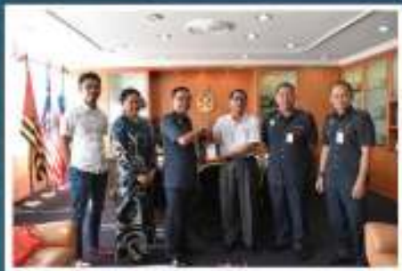
Courtesy Visit to Fire Department of Sabah