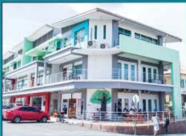
GEOMATIKA COLLEGE KENINGAU, KENINGAU, SABAH