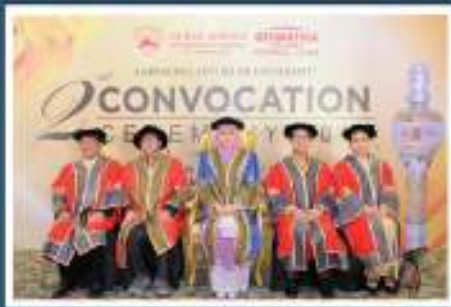
2 nd Convocation Ceremony