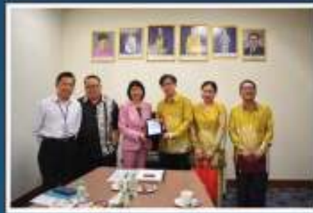
Courtesy Visit to UPEN