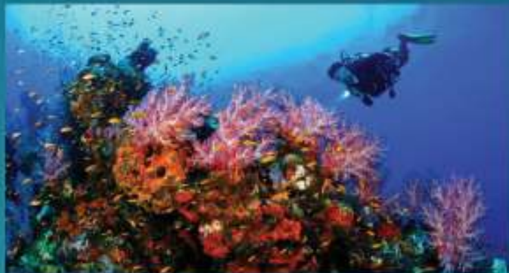
SABAH'S CORAL REEFS

The marine park is a cluster of Five islands - Pulau Gaya, Pulau Sapi, Pulau Manukan, Pulau Mamutik and Pulau Sulug is about 20 minutes by speedboat from the city. Take a dip in the waters for a snorkel, a dive or some sea walking. Or stay on the shore and bask in the sun with a picnic basket.