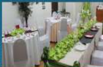
DINING SIMULATION ROOM