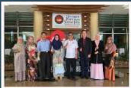
MoU Signing with Universiti Pendidikan Sultan Idris (UPSI)