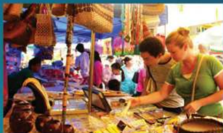
GAYA STREET, KOTA KINABALU

The centre attracts tourists and researchers alike, giving them the opportunity to watch the Orang Utan up close in their natural habitat. A broadwalk which leads to a viewing gallery and feeding platform where the Apes are fed milk and banana twice a day at 10am and 3pm by rangers. Feeding time also attracts long-tailed macaques to the area.