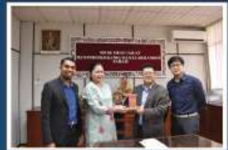
Courtesy Visit to Ministry of Rural Development Sabah