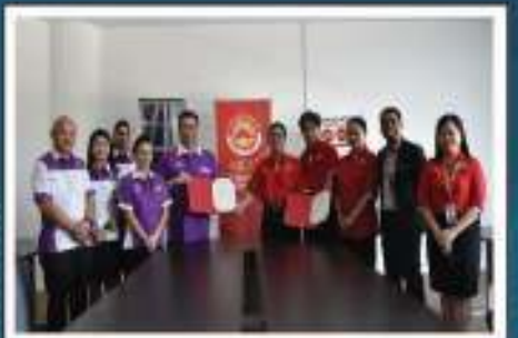
MoU Signing with Ascot Academy