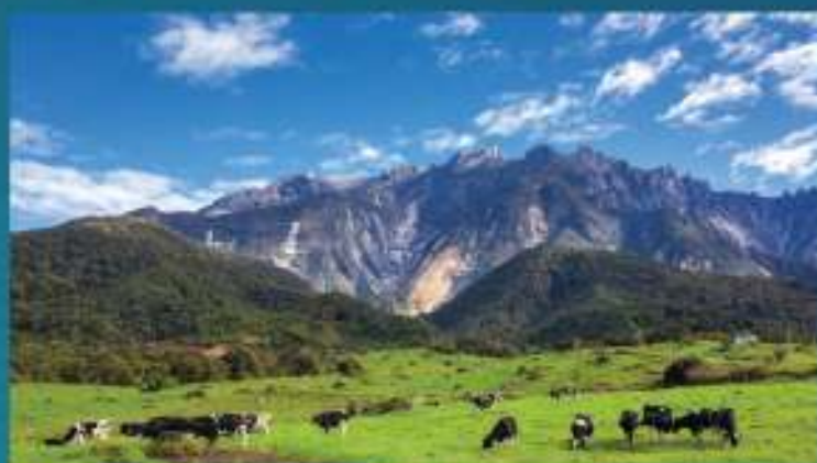
KUNDASANG, MOUNT KINABALU

Kundasang, Sabah is the place all of us have always drawn as a child - a small wooden house with a magnificent view over the paddy fields and the majestic Mount Kinabalu. If you are keen in exploring the best of Sabah, Kundasang is guaranteed to take your breath away with its majestic views.