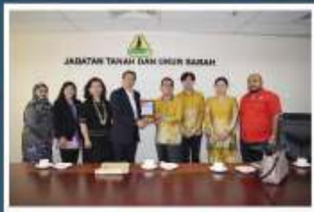
Courtesy Visit to Land Survey Sabah