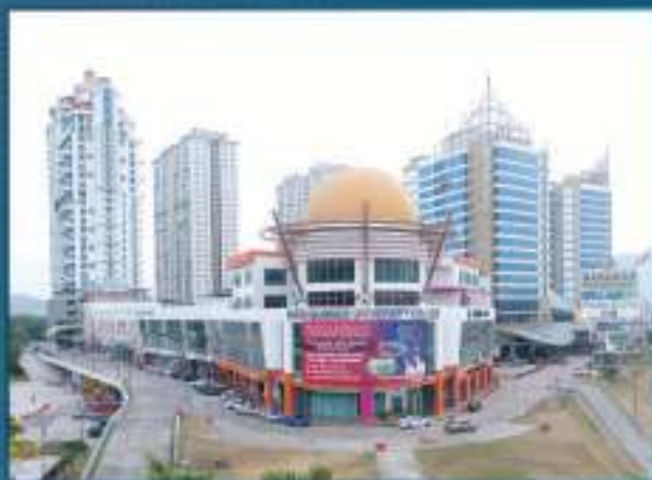
NORTH BORNEO UNIVERSITY COLLEGE, KOTA KINABALU, SABAH