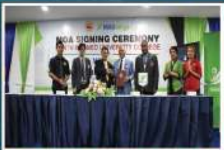
MoA Signing Ceremony with MASwings