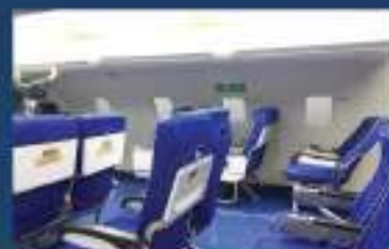
CABIN CREW SIMULATION ROOM