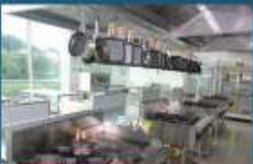
KITCHEN SIMULATION ROOM