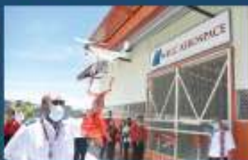
NBUC AEROSPACE HANGAR