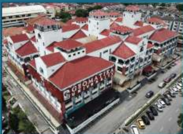
GEOMATIKA UNIVERSITY COLLEGE, KUALA LUMPUR