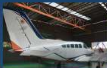
NBUC AEROPLANE HANGAR