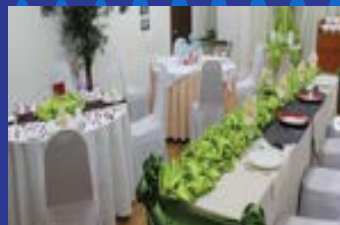
DINING SIMULATION ROOM