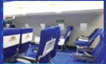
CABIN CREW SIMULATION ROOM