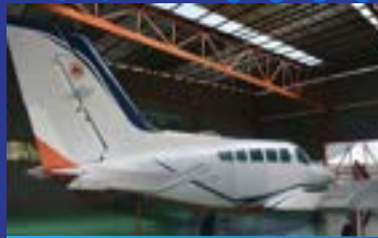
NBUC AEROPLANE HANGAR