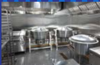
CULINARY SIMULATION AREA