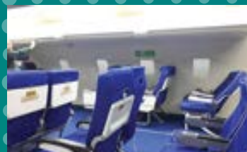
CABIN CREW SIMULATION ROOM