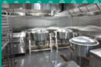
CULINARY SIMULATION AREA