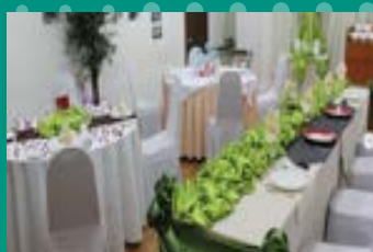
DINING SIMULATION ROOM