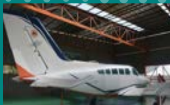
NBUC AEROPLANE HANGAR