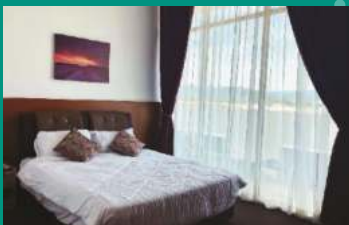
HOTEL SIMULATION ROOM