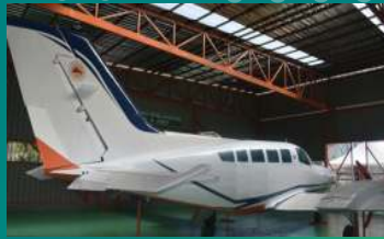
NBUC AEROPLANE HANGAR