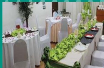
DINING SIMULATION ROOM