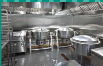
CULINARY SIMULATION AREA