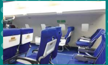
CABIN CREW SIMULATION ROOM