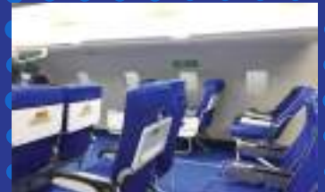
CABIN CREW SIMULATION ROOM