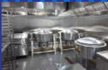
CULINARY SIMULATION AREA