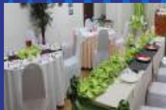
DINING SIMULATION ROOM