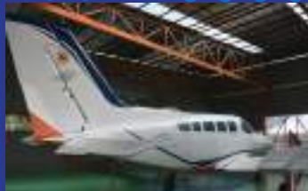
NBUC AEROPLANE HANGAR